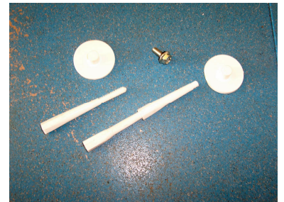
Standard 5/16" bolt